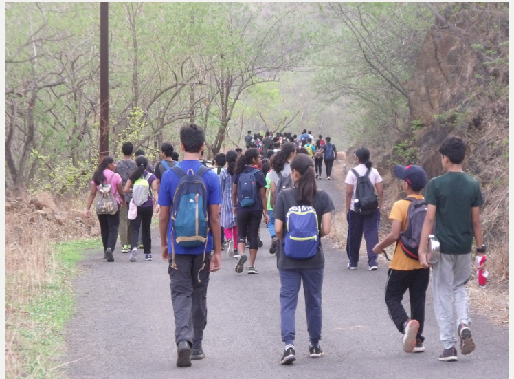
Hike to Shambhu Hill

Upon reaching the temple, students went around exploring it and paying their respects to the idol.