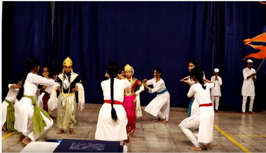
Assembly on Ashadi Ekadashi